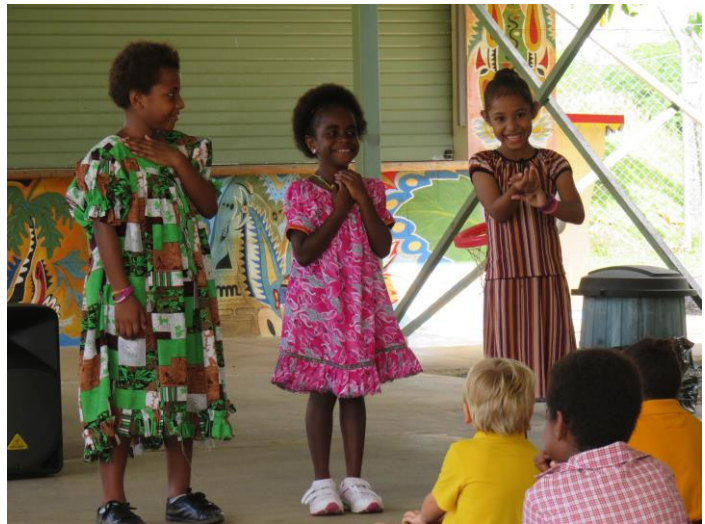
More images from Friday's "Our Granny" assembly performance by the year two class.